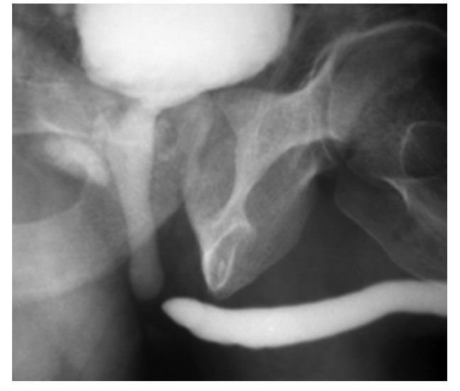
Figure 1. Simultaneous voiding cystourethrography and retrograde urethrography in a patient with obliterative urethral stricture.

The urethral catheter was left in place for 7 days. Thereafter, clean intermittent catheterization (CIC) by the patient was started with 18-F urethral catheters. The CIC regime was planned to be tapered over a 6-month period. The patients were instructed for performing CIC, and the probable complications or problems were described. The follow-up visits were planned as monthly clinical visits for 12 months, and then, every 3 months for a maximum of 24 months. All of the patients were followed up for 24 months after their last urethrotomy. Retrograde